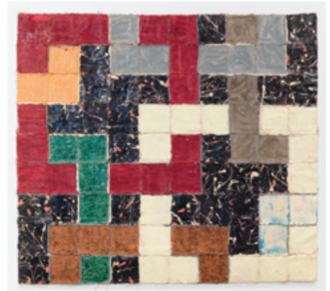
Remnants III, 1974